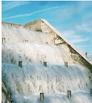
Drinking water flowing into the Lake Havasu City Water Treatment Plant from wells next to Lake Havasu.

First and foremost, Lake Havasu is the City's primary drinking water source and major water source for the Southern California Metropolitan Water District and the Central Arizona Project, which feeds water to the Los Angeles, San Diego, Phoenix, and Tucson metro areas.